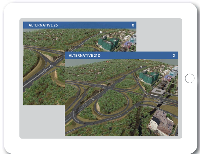
The 3D model allows viewers to see the different build alternatives from various angles and how they differ from the existing.

The model allows viewers to toggle between the alternatives, as well as to the project area as it exists today. During a PAC meeting in April, the committee members were able to see these models, looking at different project areas as they exist now and how they might exist in the future. The PAC members expressed that the models were helpful in allowing them to better understand the different alternatives.